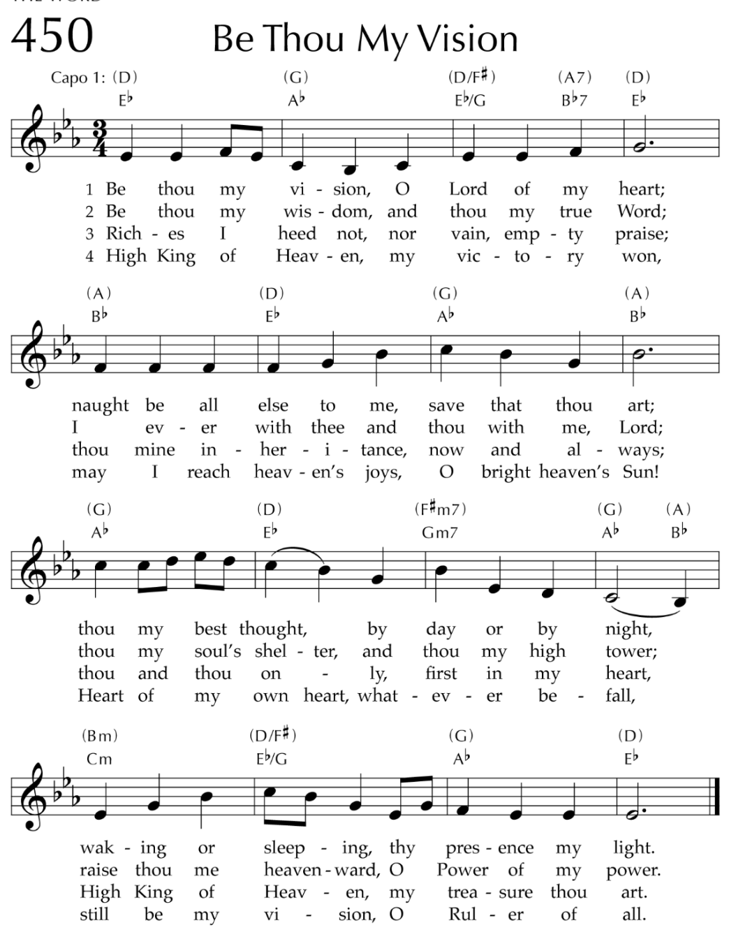
Guitar chords do not correspond with keyboard harmony.

These stanzas are selected from a 20th-century English poetic version of an Irish monastic prayer dating to the 10th century or before. They are set to an Irish folk melody that has proved popular and easily sung despite its lack of repetition and its wide range.